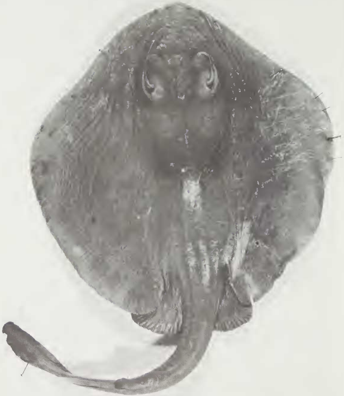
Figure 2. Trygonoptera personata , holotype, CSIRO H46.